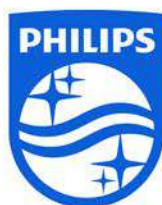
SmartBright Panel RC099V