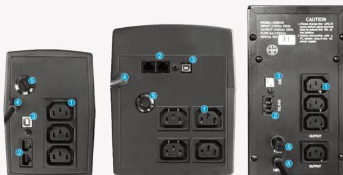
400 VA ~ 800 VA